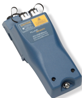
DTX Compact OTDR module