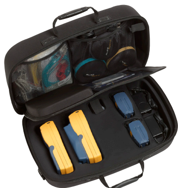
DTX Compact OTDR Kit